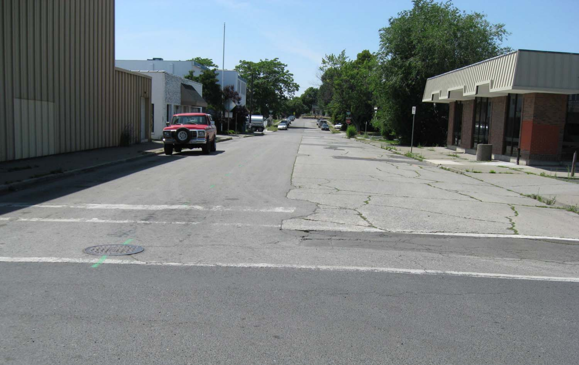
On Market looking west to Haven