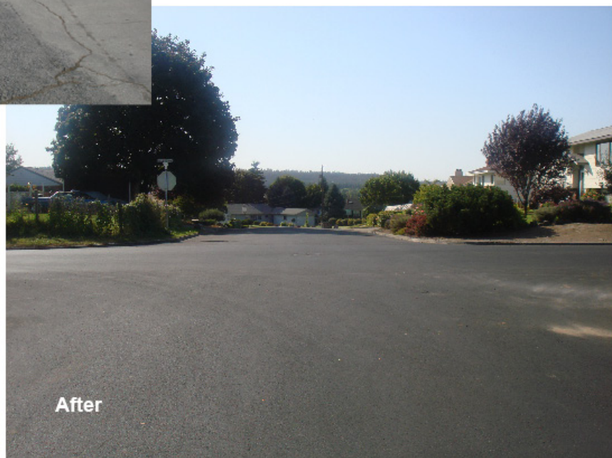
Belt Street, et al.