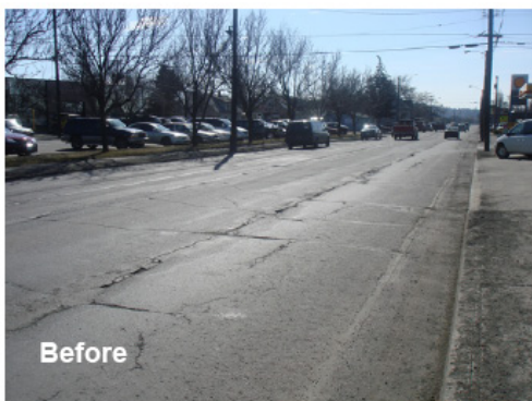
Ash Street from the Maple St. Bridge to Northwest Boulevard

Rehabilitated Maple Street and Ash Street from the Maple St. Bridge to Northwest Boulevard and paved the intersections of Maple Street and Ash Street at Northwest Boulevard and Boone Avenue with concrete. The project also included the installation of a fiber optic communications system (ITS), including new cables for traffic signals and cameras.