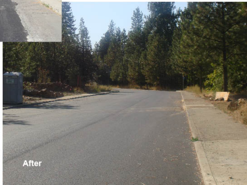
Hartson Water Main