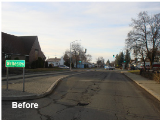
Wall Street from Wellesley Avenue to Francis Avenue

Rehabilitated Wall Street from 200 feet south of Wellesley Avenue to Francis Avenue, replaced an 18-inch water main, and paved the intersection of Wall Street and Wellesley Avenue with concrete.